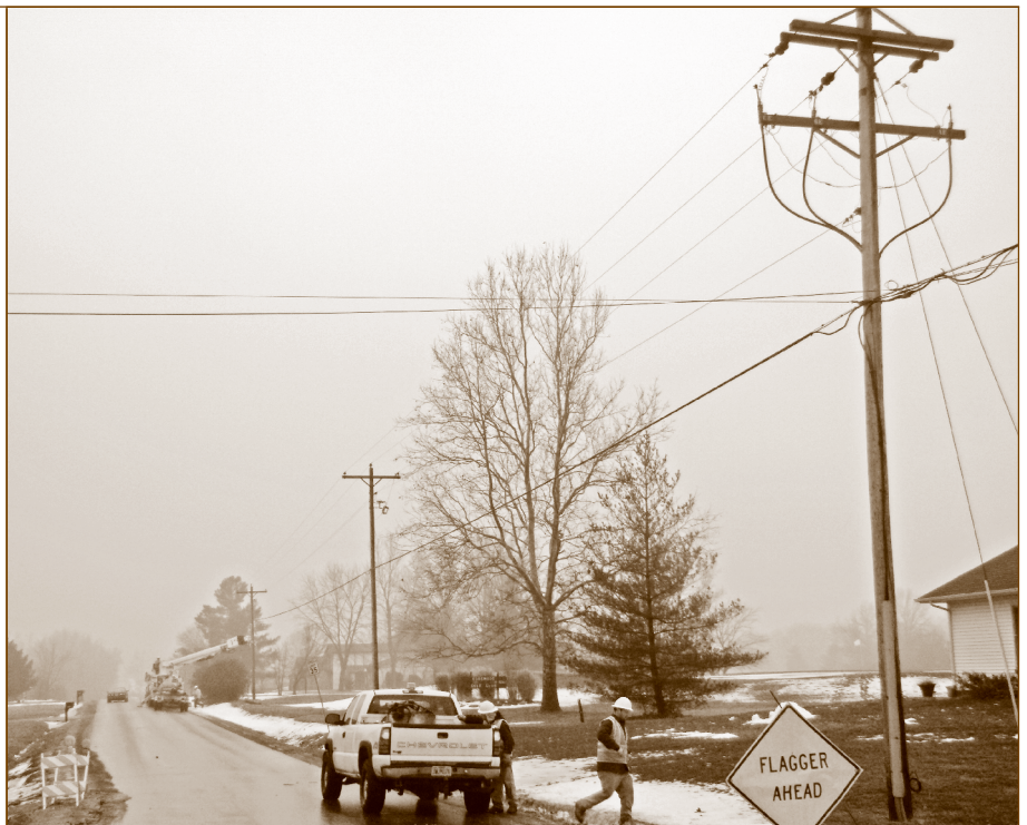
Work was nearing completion in late January on an upgrade of three-phase poles and wires along Kennedy Road in Auburn, next to Edgewood Golf Course.

"If it's going to take some time to repair a transmission or substation problem, our crews can switch the lines to bring power in from another area," DeLaby explains. He says new, larger transformers to be installed at the co-op's Harvel, Farmersville and